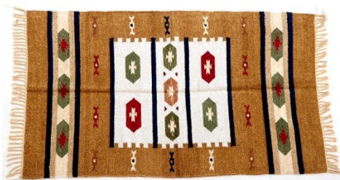
CARPETS WITH WOOL AND RAYON

Rayon is known as artificial silk. the source material for rayon is wood pulp. It is the only synthetic fibre obtained from plant's cellulose and so it is called cellulose fibre. The cellulose that was collected from wood or bamboo pulp, is treated with several chemicals. First sodium hydroxide is added and then carbon disulphide to the cellulose. The cellulose dissolves in chemicals added to it and gives a syrup called viscose. Viscose is forced through a Spinneret into a solution of dilute sulfuric acid. This gives us silk like threads. The threads are cleaned with soap and dried. This new fibre is called rayon which is an artificial.