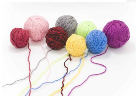
WOOLLEN TREADS FOE KNITTING

It looks like natural wool. It can be considered as artificial wool. It is generally called 'fake fur'. It is made from the combination of coal, air, water, oil and limestone. It is spun by either dry spinning or wet spinning. In dry spinning the dissolved polymers are extruded into warm air. The fibres solidify by evaporation. In wet spinning the polymers are dissolved and extruded into a bath and then dried. The wool obtained from natural sources is quite expensive, whereas clothes made from acrylic are relatively cheap.